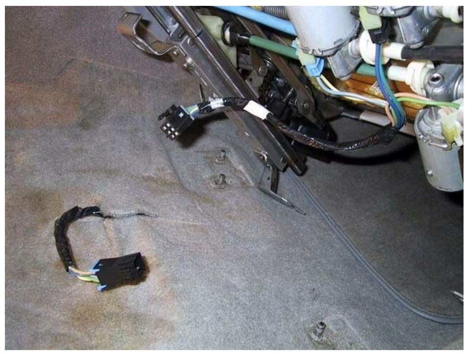
-Lift the seat and turn it so that the seat is facing your stomach.