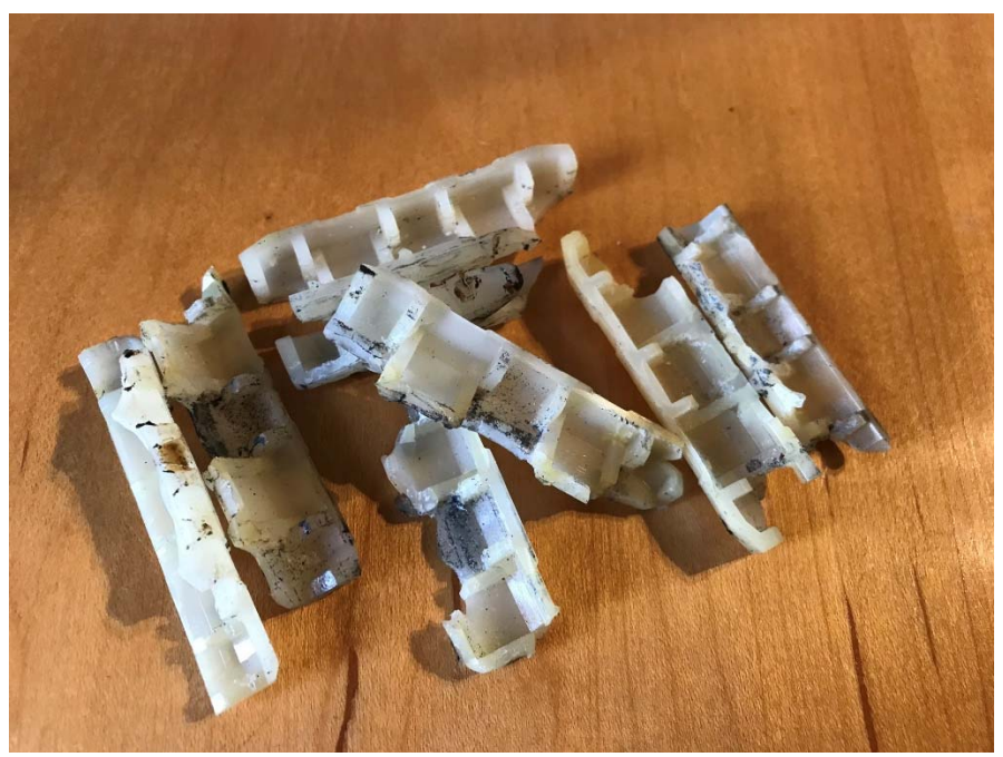
-Ensure the seat track is clean and free of debris before installing the new sliders.