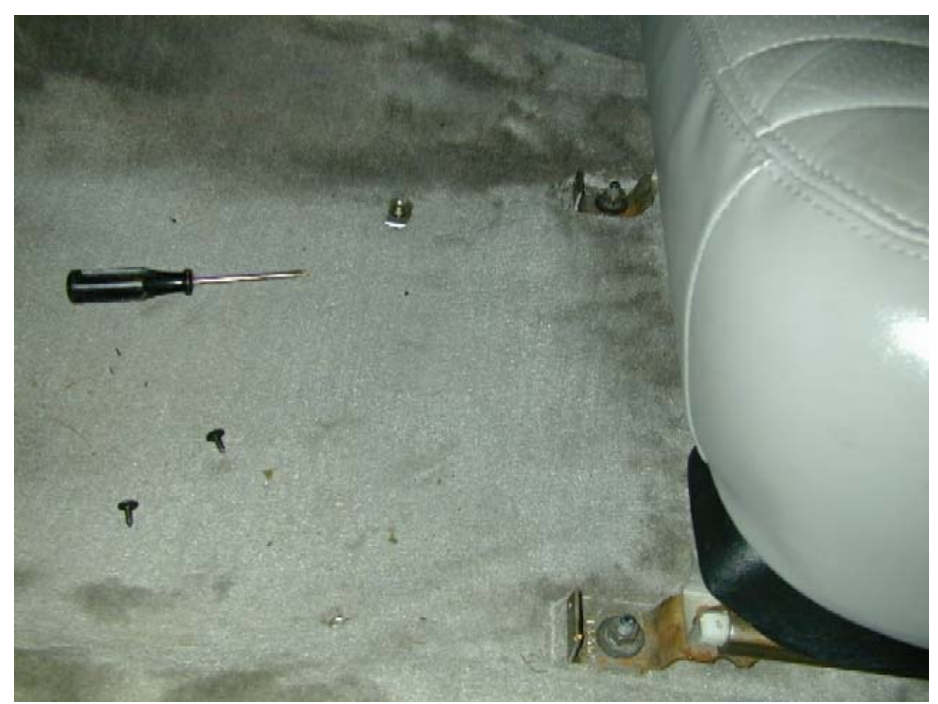
-Move the seat forward and remove the rear trim covers. -Remove the 4 remaining bolts with a 13mm socket.