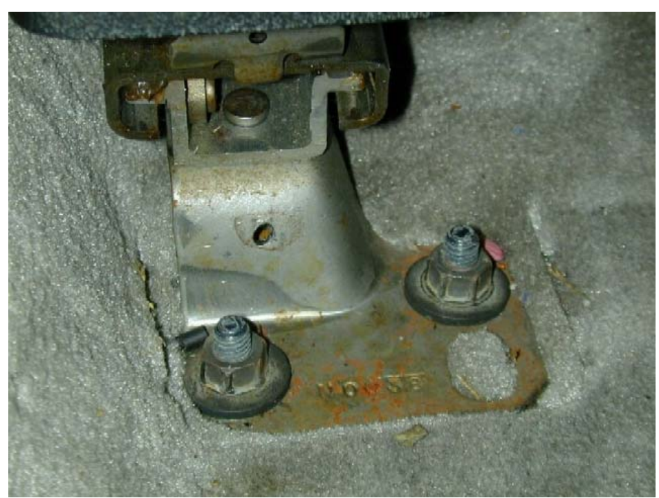
-Disconnect the power seat electrical connector.