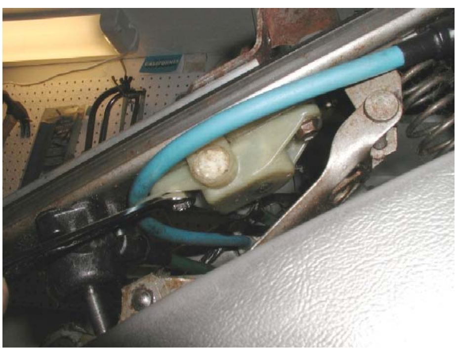
-Once the bolts are removed, a slight tug will remove the gear box.