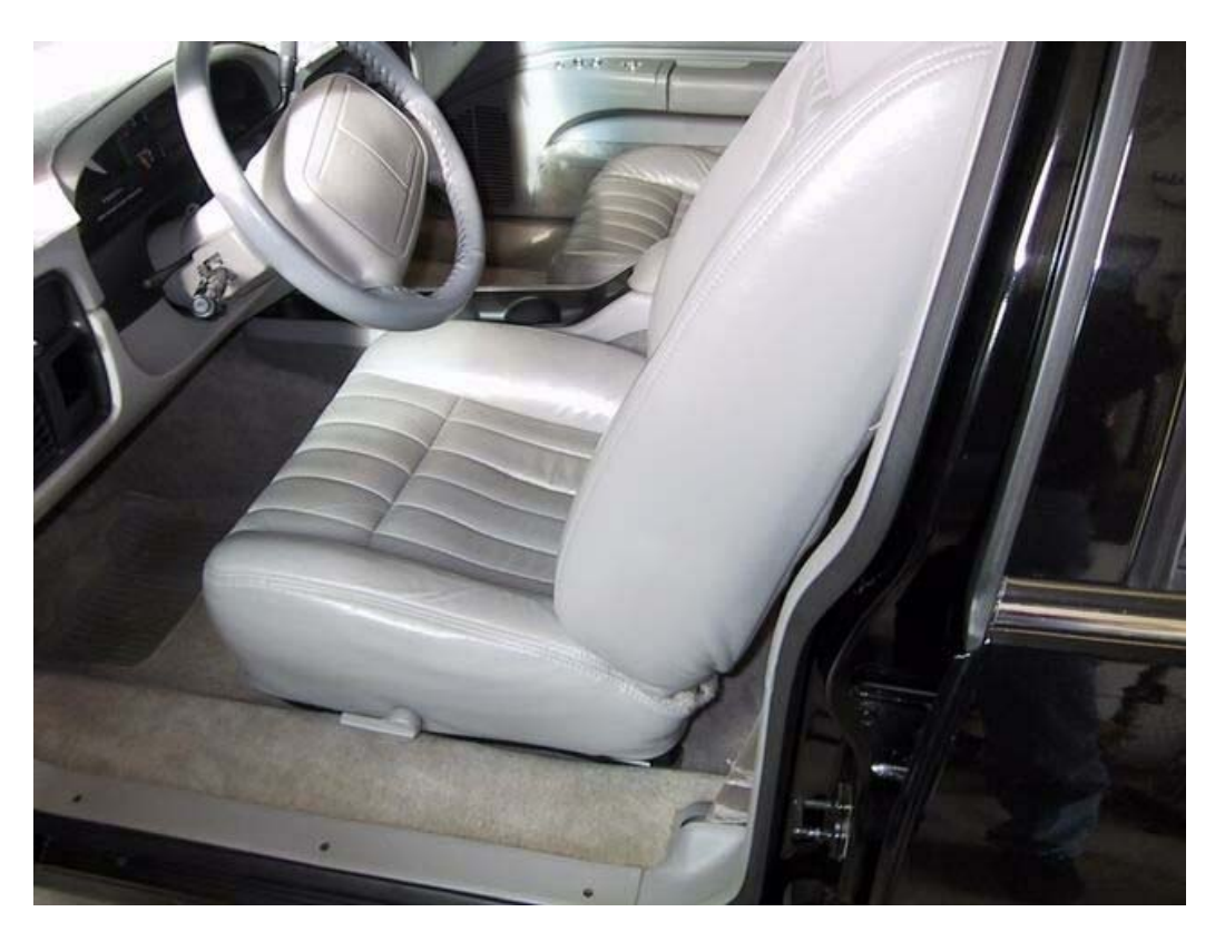
-You are finished. Congratulations.