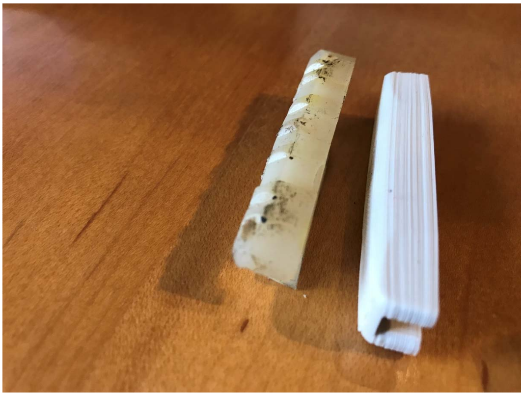
-Make sure the curved parts of the sliders face outward when reinstalling. -Some sanding may be required on the sliders to ensure smooth operation.

- Due to inconsistency in the factory parts from one year to the next, You may need to file the seat track for the sliders to fit. plus there is a rivet that may need some slight filing to operate smoothly.