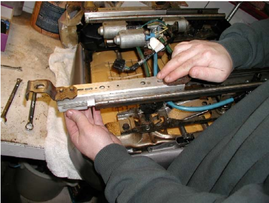
-Remove all of the old broken sliders.