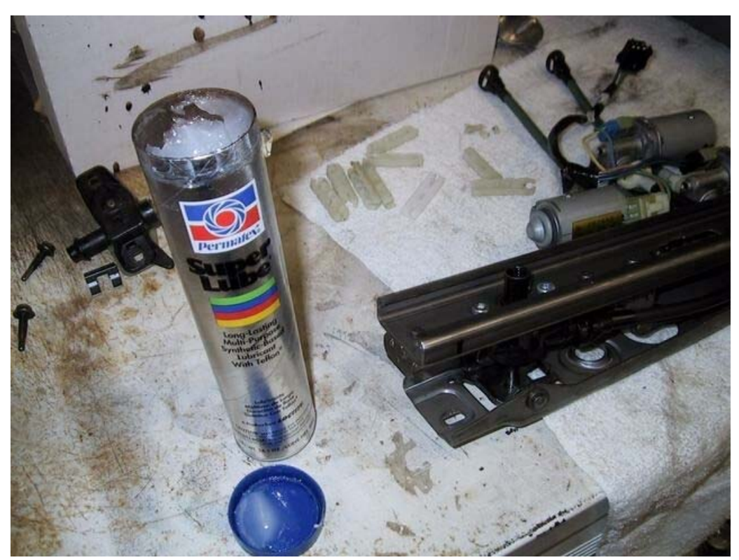
-Apply lubricant to steel track. A multi-purpose synthetic based lubricant with Teflon to prevent friction and wear. Withstands temperatures from -45F. to 450F.