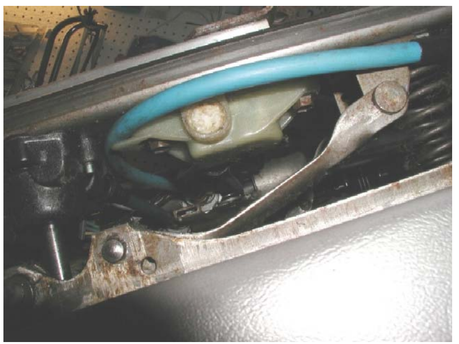
-Find the two bolts holding the actuator in place. (Both Sides) Mark location so as to return them to the exact same place. -Remove the bolts using a 10 mm wrench.